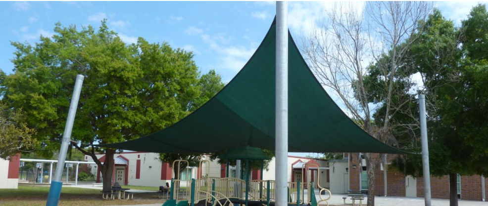
LOW COST MANUFACTURER

Comparing superior engineering & design by Apollo Sunguard to inferior engineering & design by low cost manufacturers.