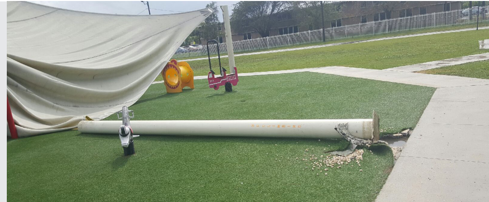
LOW COST MANUFACTURER